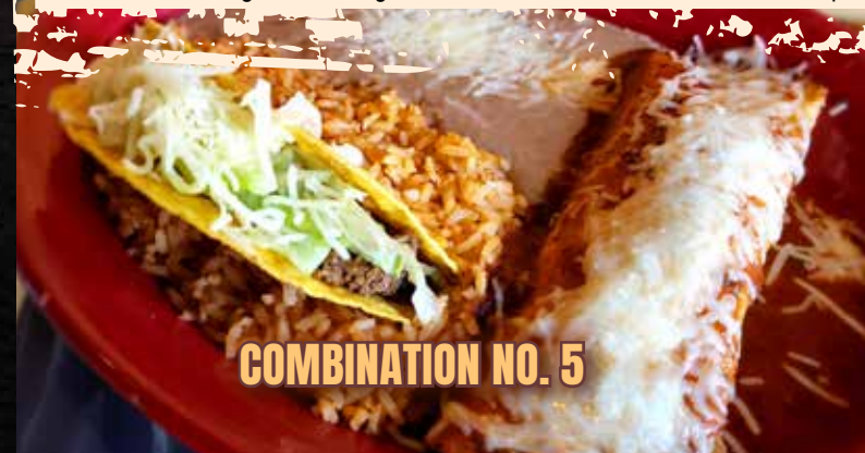
COMBINATION NO. 5

*Warning: Consuming raw or undercooked foods such as meat, poultry, seafood, shellfish or eggs may increase your risk of foodborne illness.