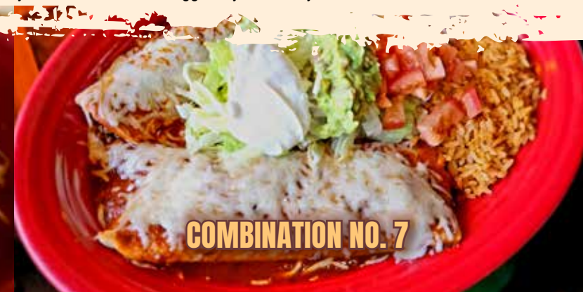
COMBINATION NO. 7