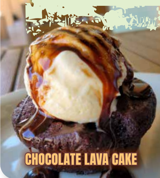
CHOCOLATE LAVA CAKE

CHOCOLATE LAVA CAKE WITH ICE CREAM - 9.99