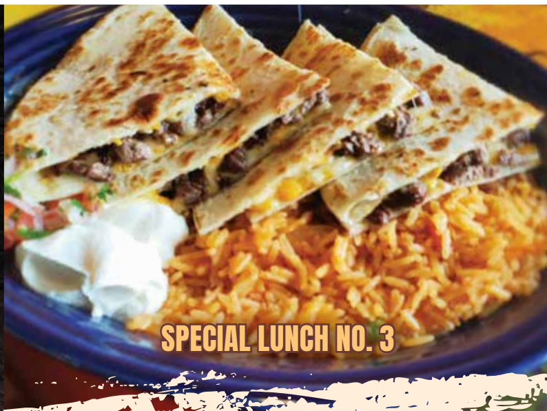
SPECIAL LUNCH NO. 3