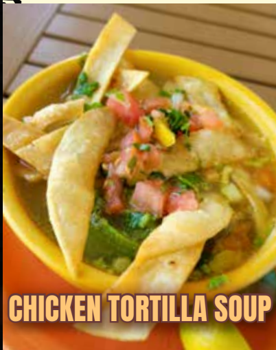
CHICKEN TORTILLA SOUP

*Warning: Consuming raw or undercooked foods such as meat, poultry, seafood, shellfish or eggs may increase your risk of foodborne illness.