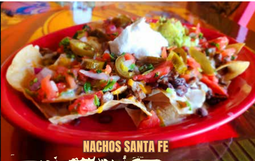
NACHOS SANTA FE