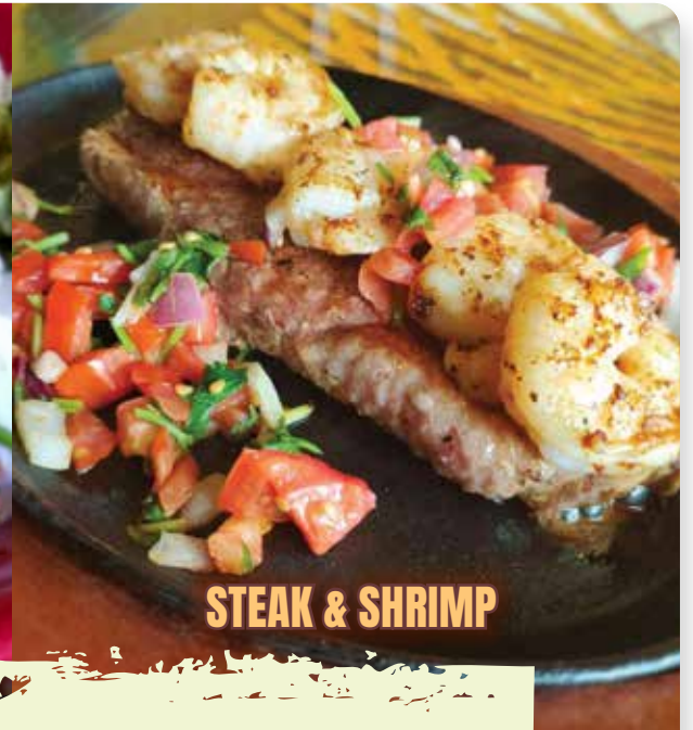
STEAK & SHRIMP