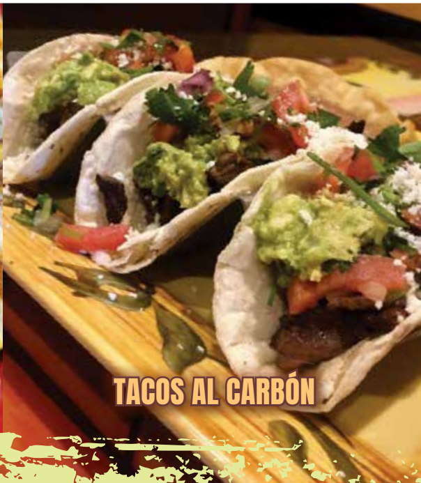
TACOS AL CARBÓN