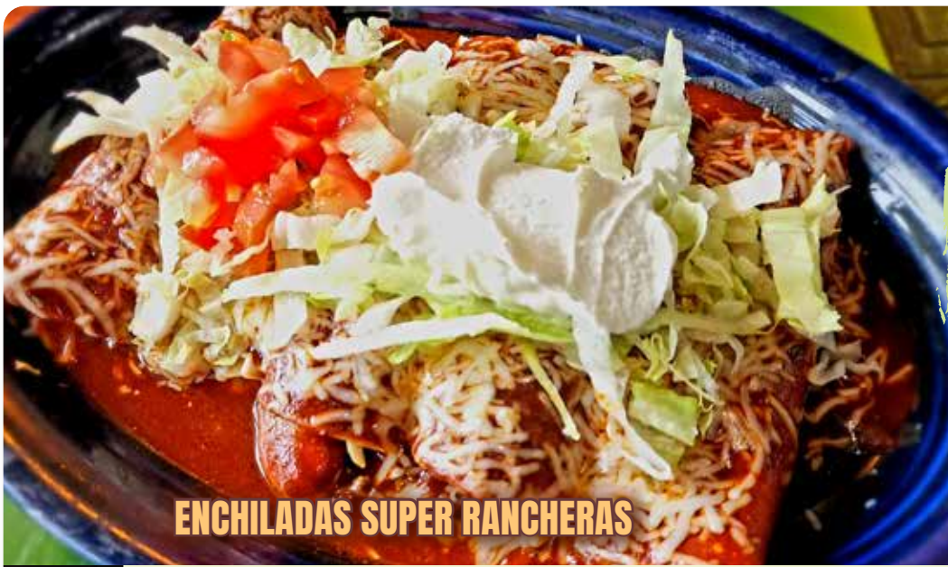
ENCHILADAS SUPER RANCHERAS